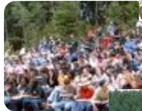
Special Thursday night Chuck Wagon and service outdoors on the hillside!